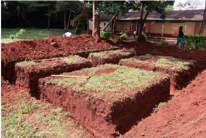
figure 2: Ongoing construction of the ablution block.