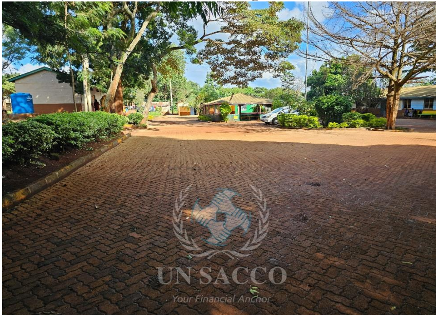
Figure 3: Inside Mji wa Huruma. Dormitories/Residence on the right and left of photo.